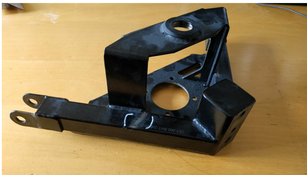
Picture 2. Photo of the bendix mounting.